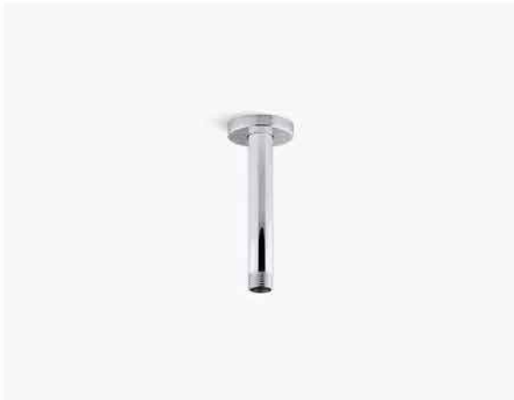
6" ceiling-mount single-function rainhead arm and flange