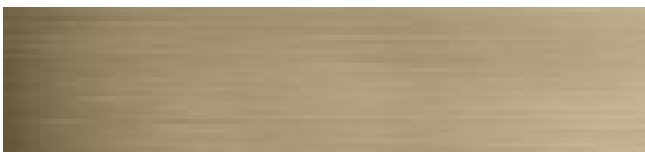
Brushed French Gold