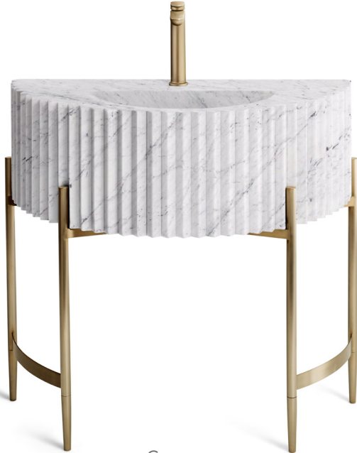
Carrara Gold Finish