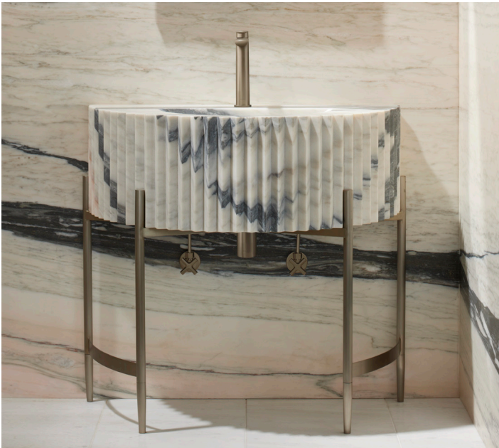
Shown in Vecchia marble top and Brushed Nickel Base