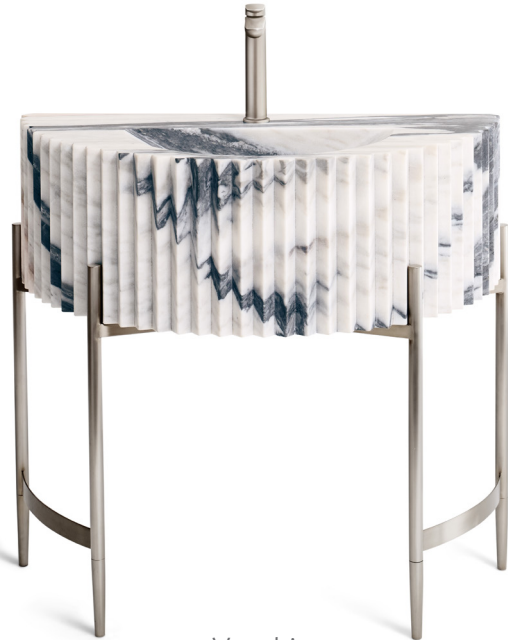
Vecchia Nickel Finish