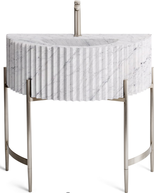
Carrara Nickel Finish