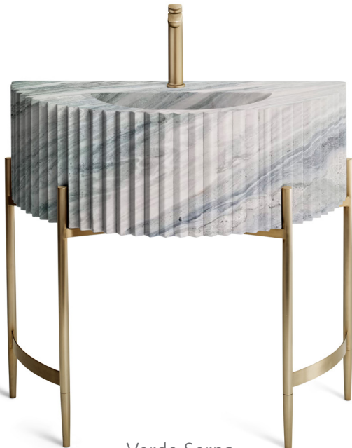
Verde Serpa Gold Finish