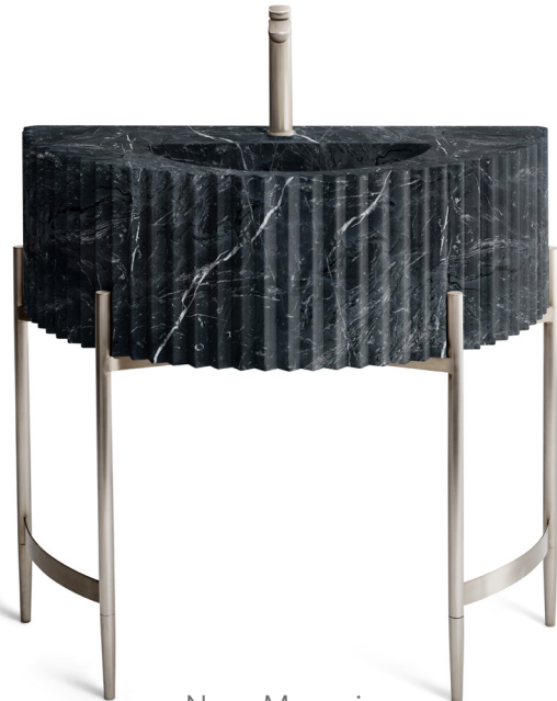
Nero Marquina Nickel Finish

*Please note: variations in color, shade, surface texture and size are natural characteristics of all our products and should be expected. Images shown are representative, but may not indicate all variations in these characteristics.