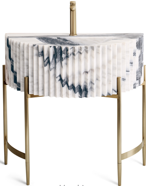
Vecchia Gold Finish