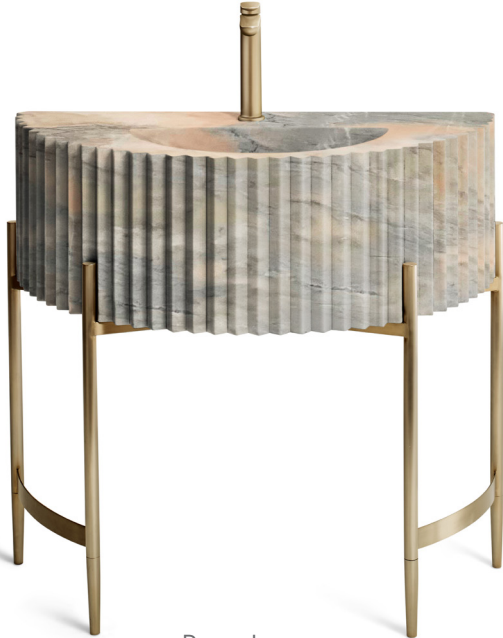
Rosa Lagoa Gold Finish