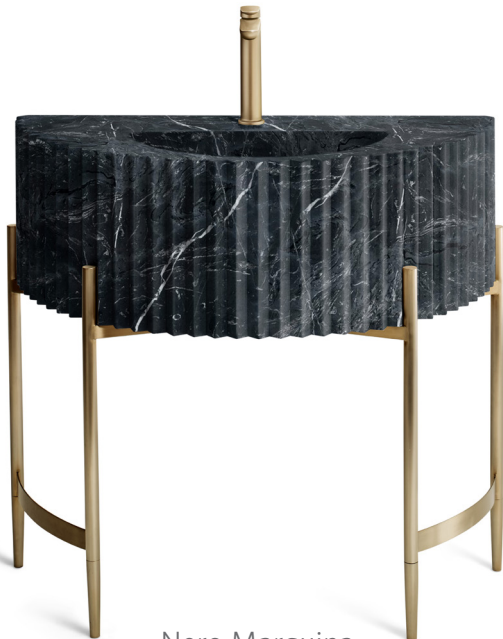
Nero Marquina Gold Finish