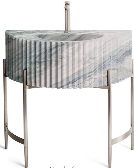
Verde Serpa Nickel Finish

*Please note: variations in color, shade, surface texture and size are natural characteristics of all our products and should be expected. Images shown are representative, but may not indicate all variations in these characteristics.