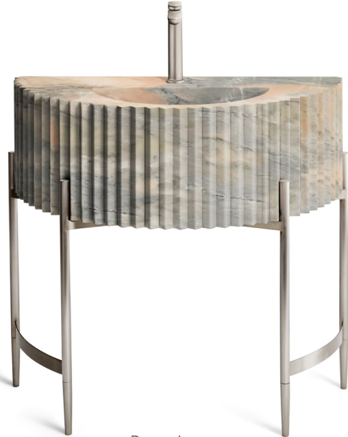
Rosa Lagoa Nickel Finish