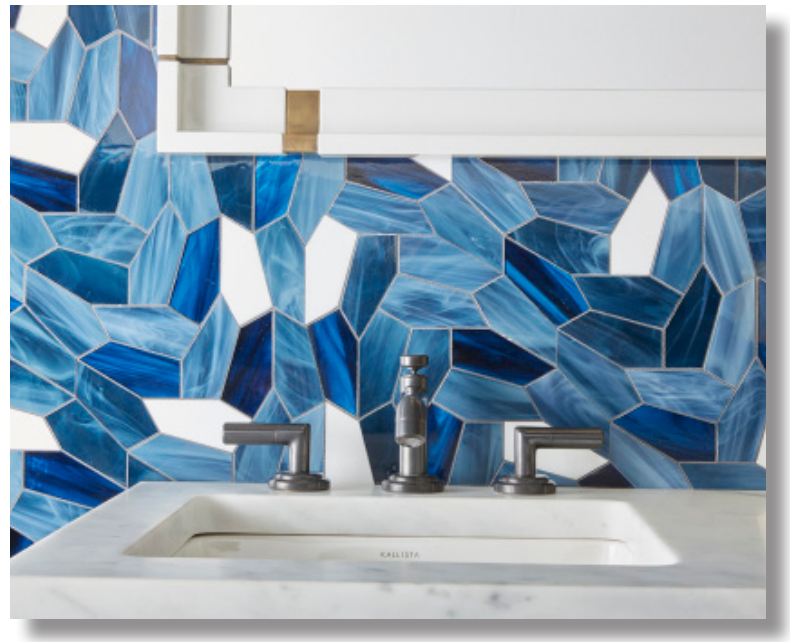
Shown: Chrysalis Playa Mosaic

Chrysalis is a collection of hand cut and fitted artisan glass mosaics that stand out for their beauty and craftsmanship. The delightfully creative patterns, breathtaking palette and skillfully executed fabrication have made this an excellent option for residential and commercial applications that demand attention.