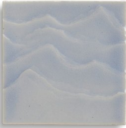
Light Blue Grey