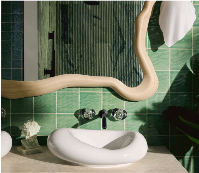
6" x 6" Dark Celadon