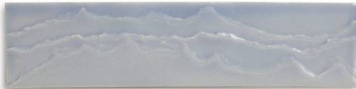
Light Blue Grey