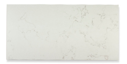
Natural 12"x24" 24"x48"