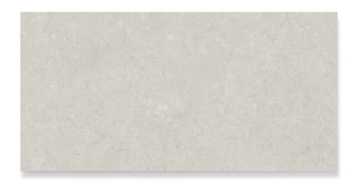
Natural 12"x24" 24"x48"