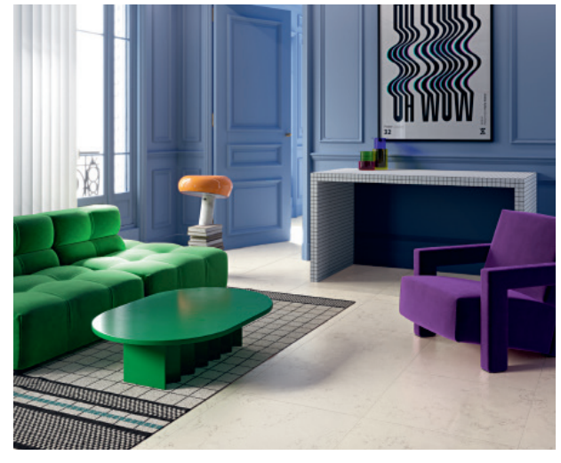
24"x48" Natural in White

This warm and natural stone-look porcelain is anything but basic. Offered in a range of natural colors, finishes and formats, this Italian porcelain was designed to be artfully combined. The versatile collection is ideal for both residential and commercial spaces, as well as interior and exterior projects.