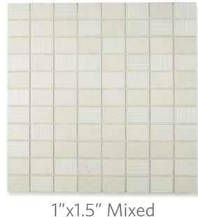
1"x1.5" Mixed White