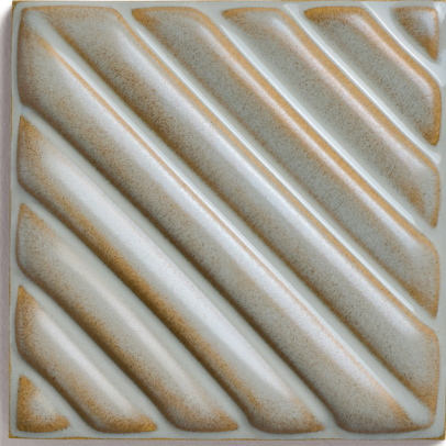
8" x 8" Fluted