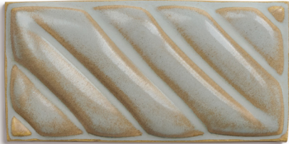
4" x 8" Fluted