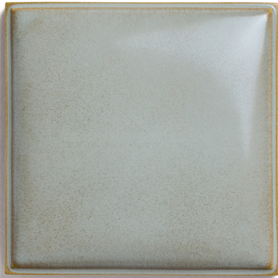
8" x 8" Smooth