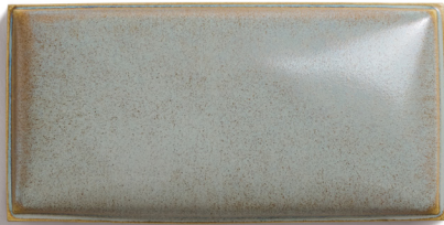
4" x 8" Smooth