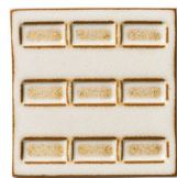
4"x4" Prose A