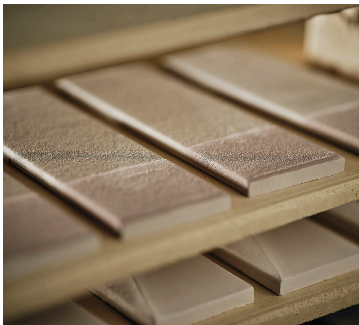
MADE Vistas 3"x9" in Flannel over White Shimmer

Handcrafted in our Portland, Oregon factory, MADE Vistas is the latest MADE by Ann Sacks stoneware collection. Inspired by the proportional scale of Mid-Century Modern design, Vistas uses the layering of two glazes on a single 3"x9" tile to create a two-tone effect. Vistas is available in three distinctive styles — Half Horizontal, Half Vertical and Quarter Vertical — as well as a curated color palette. Mix and match two-tone designs or pair with a solid 3"x9" field tile to create a beautiful, modern tile statement in your home.