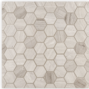
2" Hex Mosaic