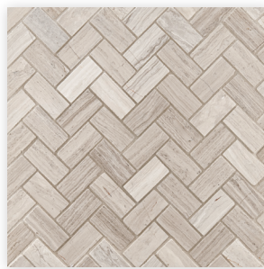
Large Herringbone Mosaic