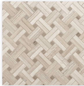
Diagonal Weave Mosaic